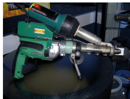
Integrated 'quick-flip' stand for easy and safe standing