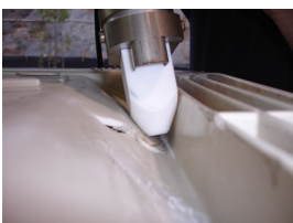
Full range of standard welding shoes and blanks for special weld shapes