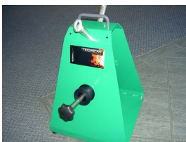
Weld rod de-reelers for easy rod handling

Advanced German engineering. Compact & very robust design with decisively less wear points than other extruders. Patented temperature measurement. Built-in stand. Adjustable handle positions. Welding shoe rotates full 360 degrees for superb handling and versatility. Full range of welding shoes. Optional rod de-reeler and full range of welding rods available.