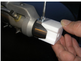
Welding shoe is easily rotated a full 360 degrees