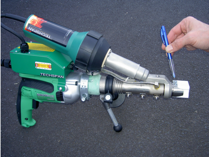
DX247 Techspan Mini CS Extruder Welder - compact & lightweight with advanced features