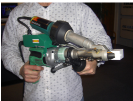
Easy to use thanks to compact ergonomic design and low weight