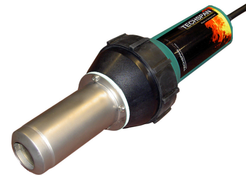
Techspan Industrial Hot Air Blower LE6600004

Please read operating instructions carefully before use and keep for future reference.